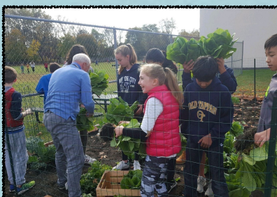
CULTIVATING THE LAND AND HARVEST.