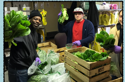
SHARING THE HARVEST WITH FOOD PANTRIES.