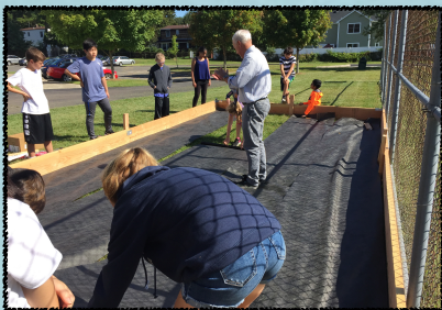
BUILDING THE COMMUNITY GARDEN.