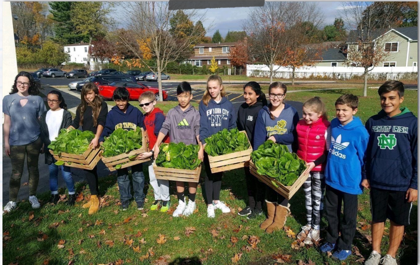
Community Garden at CDW, cultivated by Grade 7 students

This month, our eighth-grade students heard first-hand how destructive addiction actually affects young people. Our students learned from alumni that there are better choices for coping and for decision-making than drugs and alcohol. CDW students learned through others' stories.